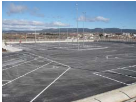
Car park of heavy vehicles. Utiel