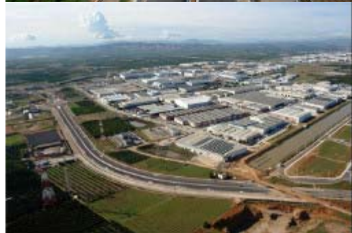
Road Access to Valencia's Logistic Platform