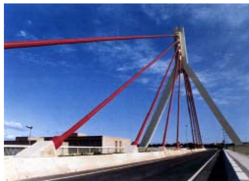
Cable-stayed bridge access to the Technology Park of Valencia. Paterna