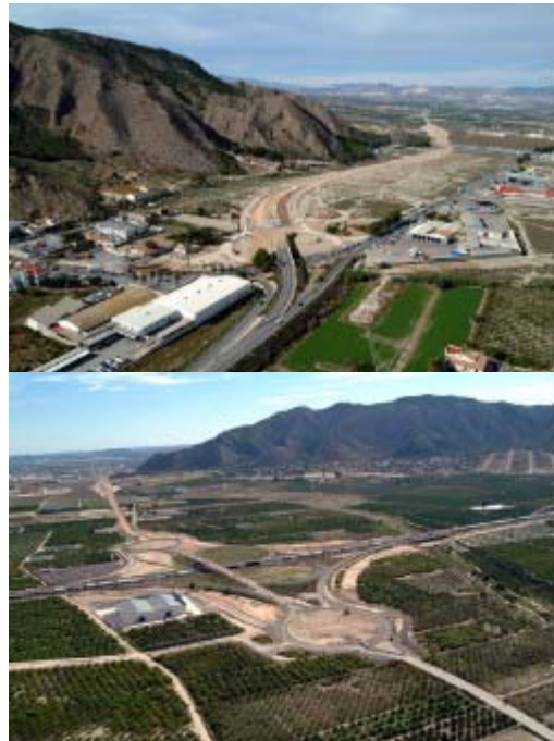
Connection Round Orihuela on A-7