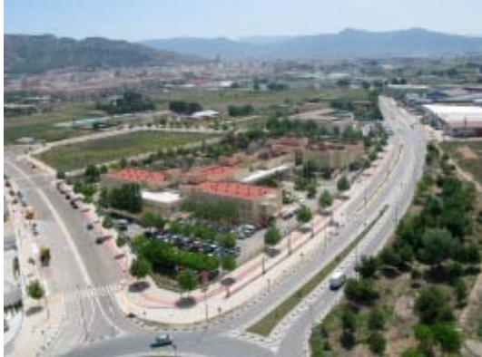
Special urban plan of equipment. Villena