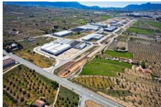
Plumbing of drinking water. Onil-Castalla