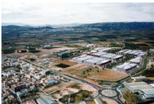
Urban plan of industrial estate Pino Blay. Cheste