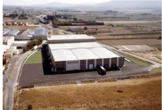
TENOTEX new factory. Beneixama