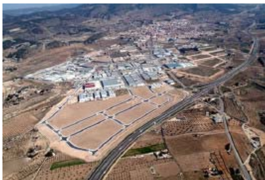
Urban plan of industrial estate L'Alfaç III Fase Oeste. Ibi