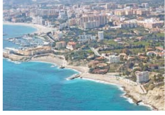
Rehabilitation of the seaside promenade of Varadero beach, Students and Tío Roig. Villajoyosa