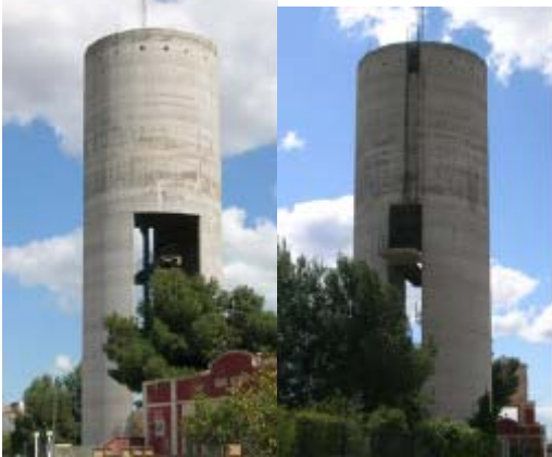
High water tank of drinking water. Catarroja