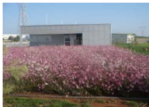
Service Parts Logistics Park Valencia. Riba-roja del Turia