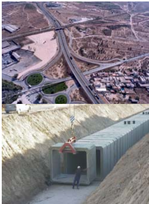
Drainage of San Vicente del Raspeig. Central Motorway Improvement (Alicante)