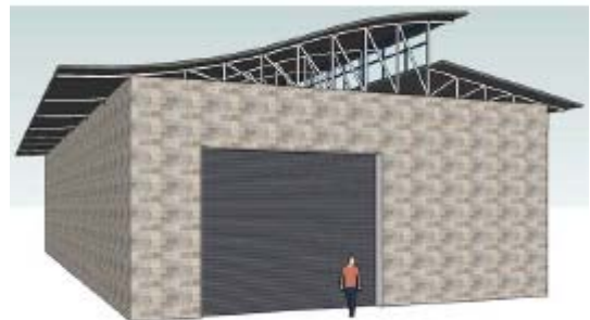
Municipal warehouse. Benilloba