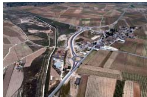
Improvement of road safety. Travesía del Rodriguillo. Pinoso