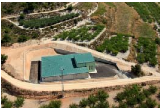
Water tank. Aiello de Malferit