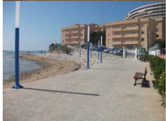
Promenade Urbanization 2ª Phase. Peñíscola