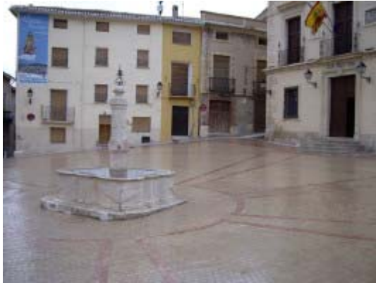
Reformation and rehabilitation of the Constitution Place. Biar