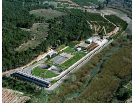
System Improvement deodorization of the WWTP Camp de Turia II. Riba-roja del Turia