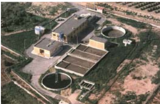
Collectors and wastewater treatment station. Bétera