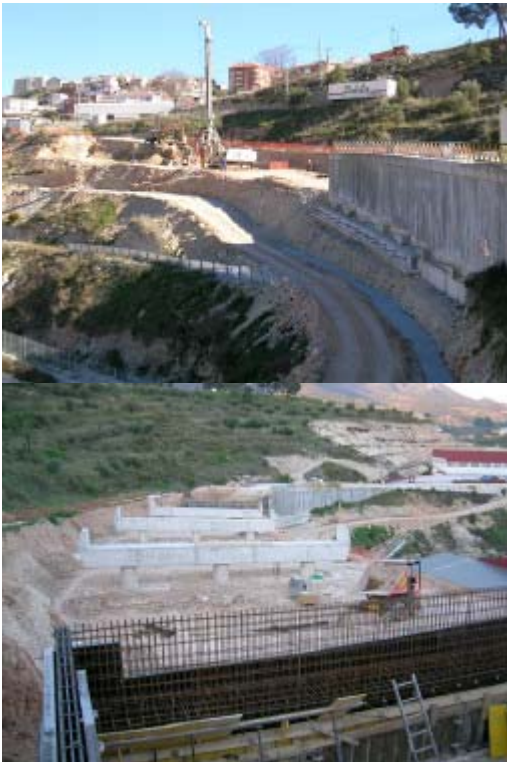
Bridge and slope stabilization of industrial estate la Beniata .Alcoy