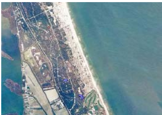
Restoration of coastal dunes with Juniperus spp in the Albufera