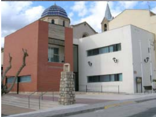
Town Hall Building. Beniarres